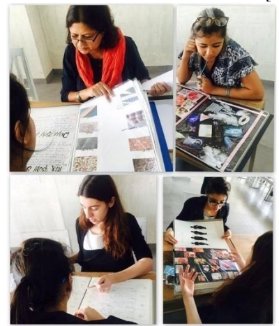
Fig. 3. International fashion project in India (participants – India, Brazil, Ukraine)

Practice in Ethiopia is followed with participation in fashionshow (fig.2). It's important to take into account orthodox Christian traditions in this country including original religious embroidery together with African features, large volume of cotton and cotton clothes [8].