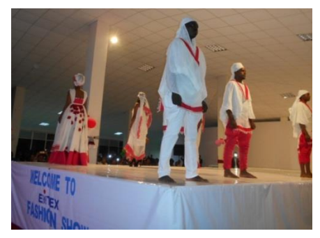
Fig. 2. Students fashion show in Bahr Dar University (Ethiopia)