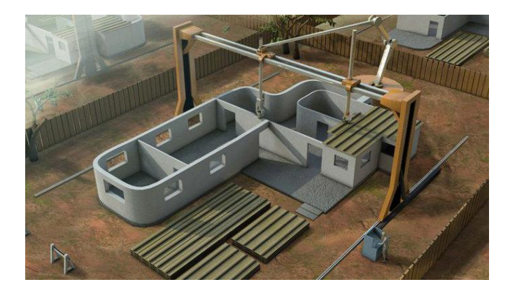
Figure 4. Contour Crafting develops 3D printing technology pioneered by Berokh Khoshnevis at the University of Southern California (2020)

capacity is 68 kWh. The creators promise that when the outside air temperature is -61°C, in the house he will be able to maintain it at +22°C. The house also has a 900-liter tank with four-level filtration. The same water can be used for 4–5 months. It is assumed that a system will be installed in the house that will control the temperature, humidity, water level in the tank, oxygen and even the weather, depending on forecasters' forecasts, adjust the room temperature. In addition, the house will be connected to the general system and in the event of any breakdown, the dispatcher will be able to fix it remotely or call a special service.