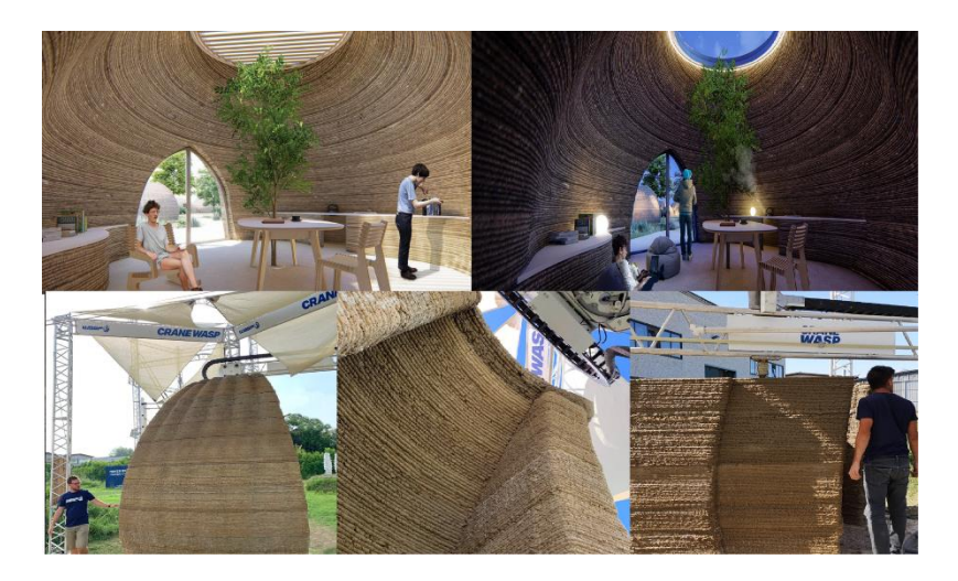
Figure 3. The result of research in 3D printing and architecture of the Italian company GAIA (2020)

There are no uniform standards, interchangeability of consumables. This is most likely a temporary problem. The fittings, communications and ceilings are still being installed manually. A layered wall surface that requires finishing if even walls are required – leveling, plastering or the use of facing materials (Figure 3) [8].