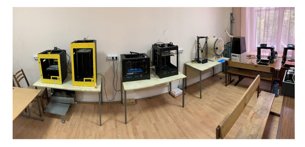
Figure 6. The educational and scientific laboratory (KNUTD)

polymers; modification of the properties of polymer materials and composites; polymeric materials based on renewable raw materials, biodegradable polymeric materials; technologies of additive formation (Figure 6).