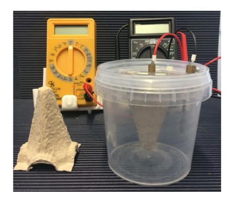
Figure 3 – The view of the real experimental setup

The working fluid was prepared: cathode compartment – glucose solution with concentration w=10%; anode compartment – 3g dry yeast was solved in 50ml deionized water until complete dissolution, and 5g of glucose was added. Measurement of the Fuel Cell performance in the open circuit mode is carried out.