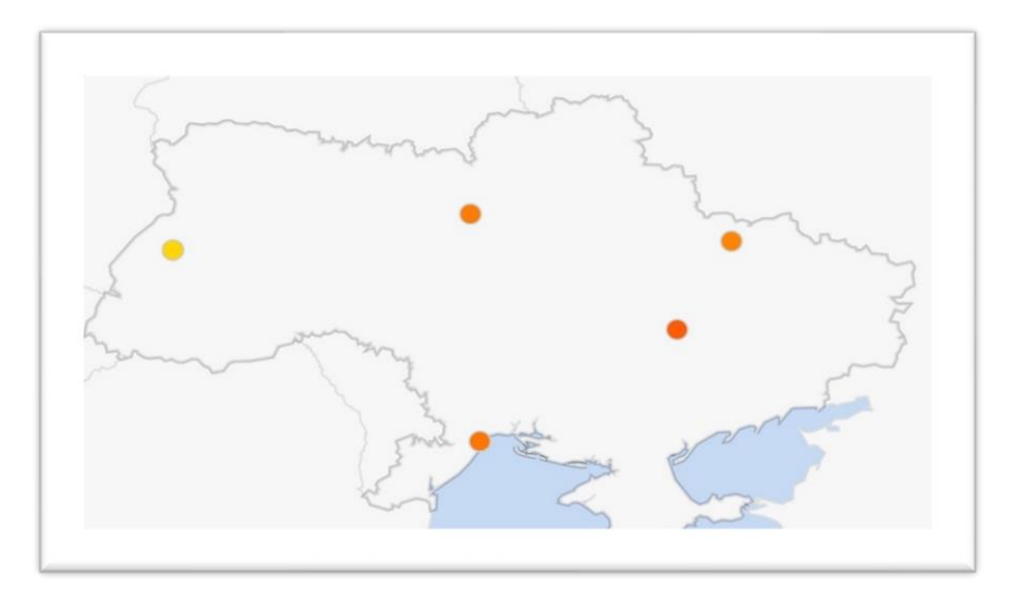
Figure 2. Map of Ukraine and cities where the measure of quality of life was conducted.

proves that the best quality of life in Australia (228,41) and the worst in Philippines (47,5) (Numbeo, 2022).