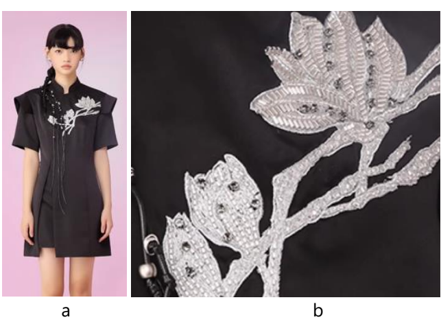
Fig. 4. Women's clothing with orchids: a – whole look; b – embroidery and beading details. Brand MUKZIN, China [20]