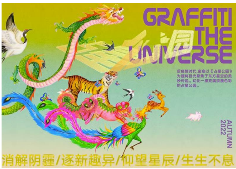
Fig. 1. Fall 2022 design theme. Brand MUKZIN, China [17]