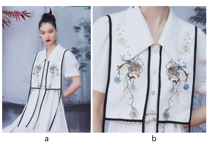
Fig. 6. Women's clothing with dragon: a – whole look; b – embroidery details. Brand Ysimo-X, China [22]