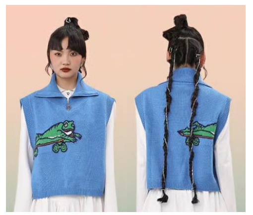
Fig. 3. Women's clothing with frog pattern. Brand MUKZIN, China [19]