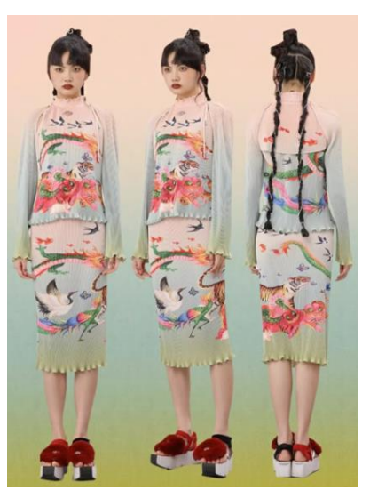
Fig. 2. Women's clothing with Chinese traditional patterns. Brand MUKZIN, China [18]