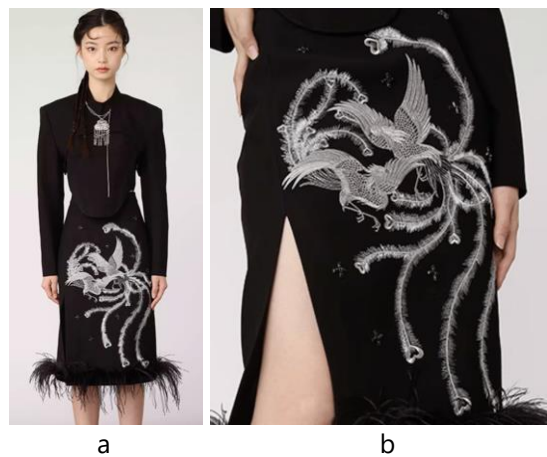
Fig. 5. Women's clothing with phoenix: a – whole look; b – embroidery and beading details. Brand MUKZIN, China [21]