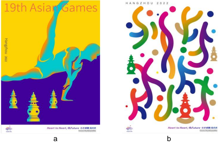
Fig. 1. Official Hangzhou Asian games poster design [3]: example a ; example b .

the Asian Games venues along with the outline of the broken bridge in West Lake, creating a visually striking mapping effect that emphasizes the vertical relationship. Both designs effectively convey the close association between the Asian Games and Hangzhou while also showcasing the distinct regional culture of the city. Furthermore, the deliberate use of graphic contrast enhances the sense of extension and creates an imaginative space within the composition.