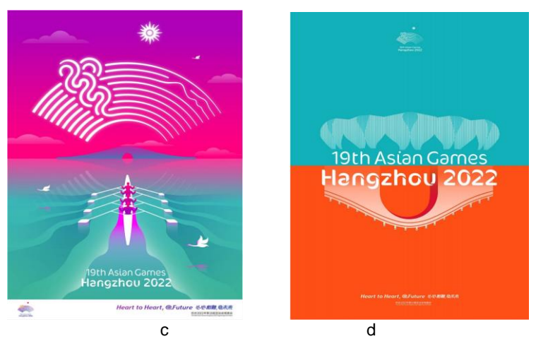
Fig. 2. Official Hangzhou Asian games poster design [3]: example c ; example d .