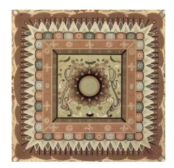
Fig. 2. Baoxiang Flower (Dunhuang Art Museum) [6]

The study of botanical motifs from the Han dynasty, at the beginning of Buddhism's eastern expansion, and the Tang dynasty, at the height of Buddhist art, reveals the evolution of Buddhist botanical motifs, the cultural connotations and aesthetic interests of the people of the time, and the fusion of art with Buddhist