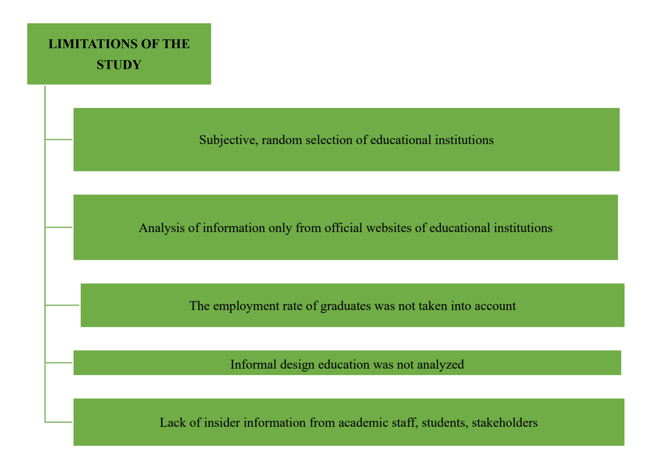
Figure 2. Of the Study of Design Education in Educational Institutions in Japan, the UK, Norway, France, and Italy