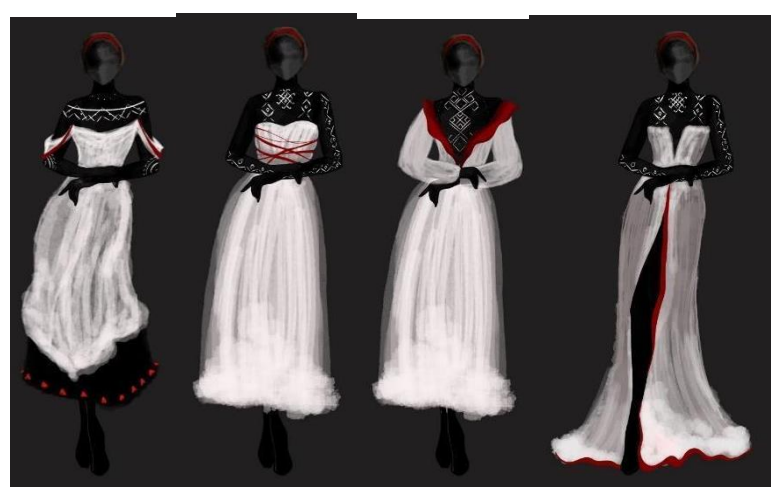
Fig. 2. Design of fashionable women's dresses in the Ukrainian style

Conclusions. Modern design cannot remain indifferent to public moods or high-profile events. Today, Ukrainian style is often present on fashion catwalks, being an inexhaustible source of inspiration for designers. The collection of women's dresses developed in the work was created taking into account modern world trends, delicately implementing motifs of Ukrainian ethno-style into modern fashion aesthetics. Traditional motifs enrich fashion trends, making them diverse and interesting both from an aesthetic and emotional point of view. The identification of the key elements of the Ukrainian style through the analysis of typical motifs and symbols made it possible to develop a modern fashion design with a distinct Ukrainian flavor.