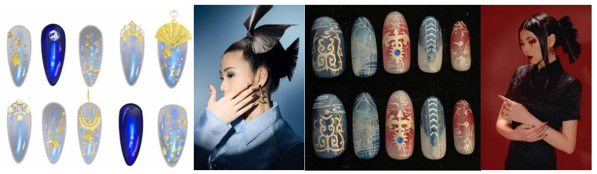
Fig. 3. Examples of Nails Product and its Motion Design effects, author Rongjie Wang, China, 2022

In addition, Chinese traditional clothing showcases distinctive patterns and colors that convey artistic and symbolic meanings. The dragon inscriptions symbolize royalty, while floral designs represent nobility and purity. Auspicious clouds, goldfish, and tuanlong