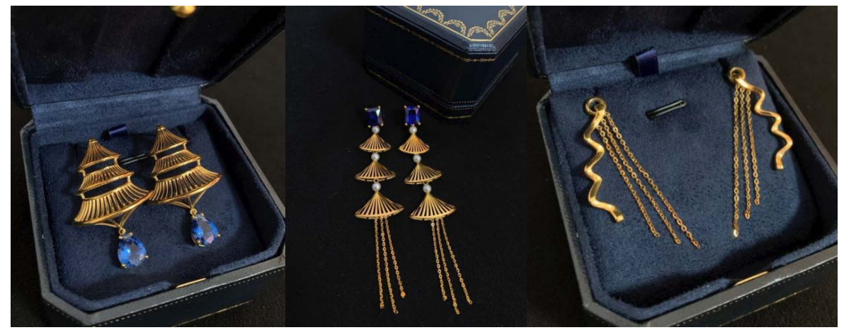
Fig. 2. Examples of Temple of Heaven earrings, author Rongjie Wang, China, 2022