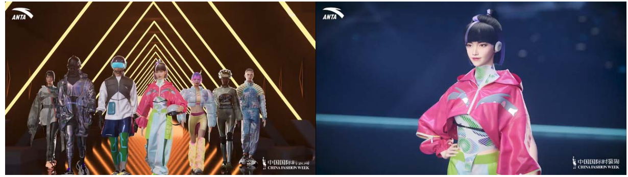
Fig. 5. Virtual idol Xi Jiajia on the virtual show of SS23 China International Fashion Week, author Baidu, China, 2022