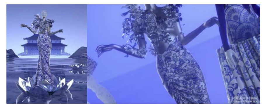
Fig. 4. Examples of designer's virtual fashion works "Qingjie"series, author Xizi Yu, China, 2022