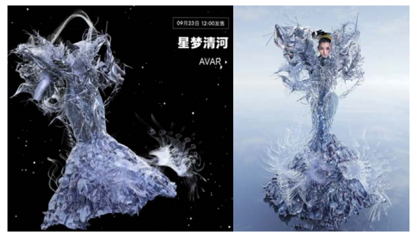
Fig. 7. Virtual fashion "Xingmeng Qinghe" from the "Deep Sea Nebula" series of AVAR virtual label, author AVAR, China, 2022