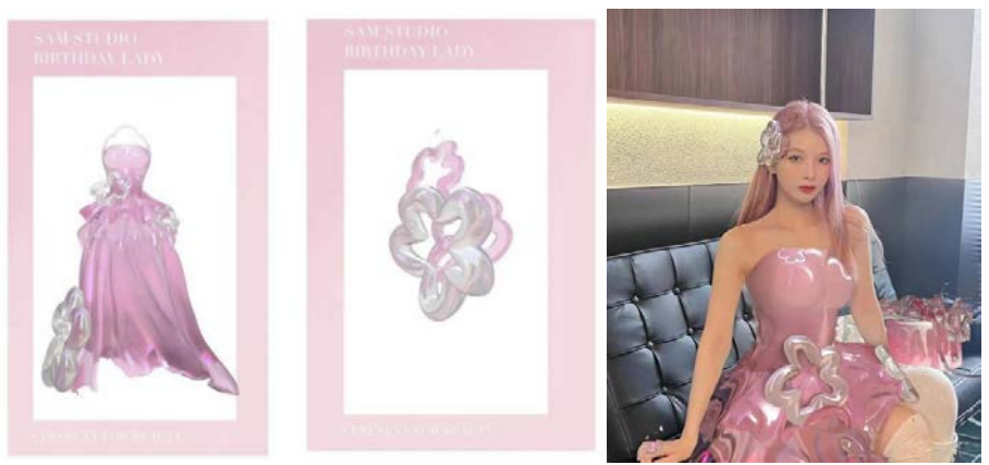
Fig. 6. Virtual Product and it's pop idol try on effect, author Shengai Miao, China, 2022