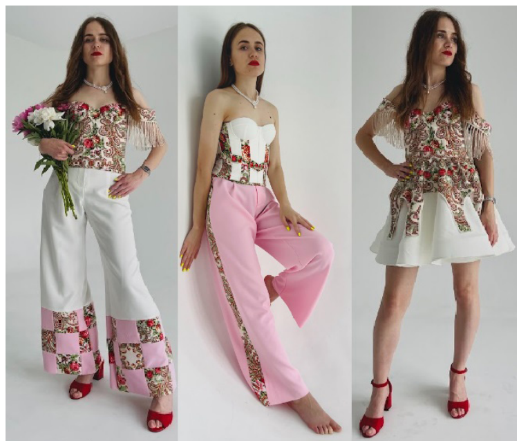
Fig. 3. Fragment of the collection "Symphony of Cultures" (Shybovska Ya., 2023)

re-manufacturing, restoration, and combining various materials. Restoring and transforming clothing help conserve valuable resources and extend its use. Recycling methods involve disassembling products into components that can be used to create new items. Upcycling as a recycling method includes creating new items by combining different textile materials. Old items can be turned into patchwork products or decorative elements. Combining materials allows for unique textural and visual effects. For the created collection, the main fabric chosen was "Barbie" suiting in two colors: milk-white and pink. The Ukrainian scarf was used as a decorative material to create interesting decorative and constructive elements.