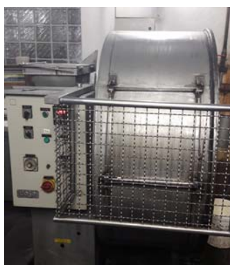
Fig. 1. The drum of the experimental department of public JSC Chynbar

In semi-industrial conditions, the water consumption for plasticization of the semi-finished product was reduced to a ratio of 1/1, and the process was carried out in a drum of the Doze company (Germany) with a volume of 0.39 m 3 (Fig. 1) at a temperature of 71–75 °C. In addition, the semi-finished product after plasticization of BCM-3 by the experimental technology 2 was subjected to filling using 1.0 % of fine silicon oxide (II) grade aerosol A-300 with the size of primary particles of 4–50 nm. and a specific surface area of 50–380 m 2 /g [14, 15], 2 % of the auxiliary synthetic duster of trupon G (Trumpler, Germany) and 5 % tannide of quebracho extract per active substance. To complete the filling process, formic acid was used after its dilution with water 1/10.